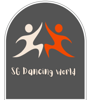
SG DANCING WORLD Founder - Suraj