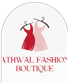
Athwal Fashion Boutique Founder - Payal