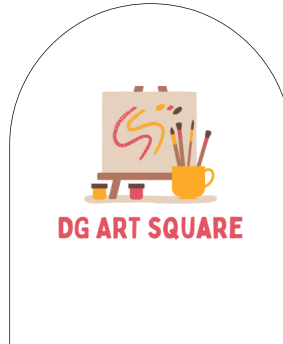
DG Art Square Founder - Dikshita