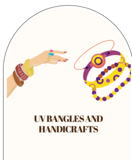
UV Bangles and Handicrafts Founder - Urmila