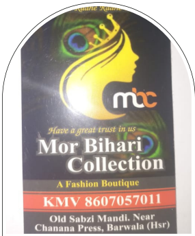
Mor Bihari Collection Founder - Minakshi