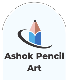
Ashok Pencil Art Founder - Ashok